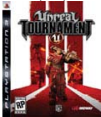
Unreal Tournament 3 (PS3)