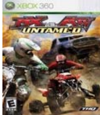
MX vs. ATV: Untamed (X360)